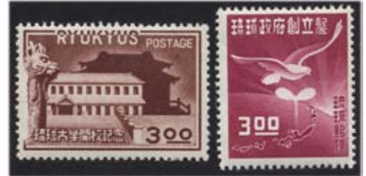
EX LOT 1854