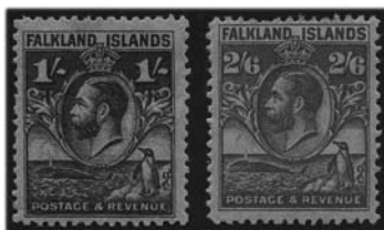
EX LOT 1757